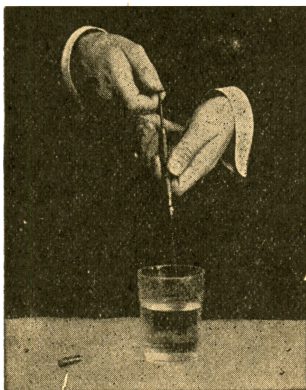
Filling the "Post."

All you have to do to fill the "Post" is to dip the nib into the ink bottle, draw out the plunger, and the pen is ready for use.