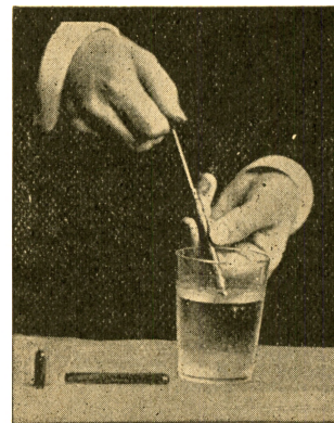
Cleaning the "Post."

All you have to do to fill the "Post" is to dip the nib into the ink bottle, draw out the plunger, and the pen is ready for use.